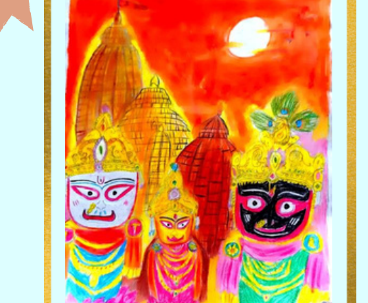
DRAWING-RISHIKA SHAW, VII