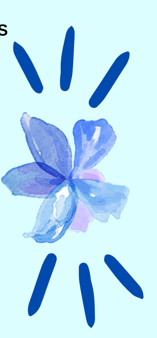
DRAWING-PURBA MOSHAN ,VI