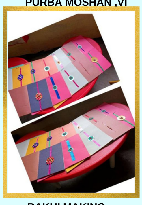
RAKHI MAKING-BY CLASS KG STUDENTS